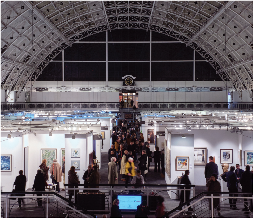
OPPOSITE AND LEFT: London Art Fair, 2023.

What sets the London Art Fair apart from others (though many are catching up) is the effort to appeal to art lovers whose pockets may not be deep.